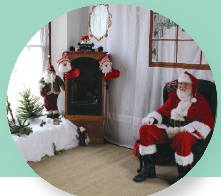
Christmas at Old Fort Concho