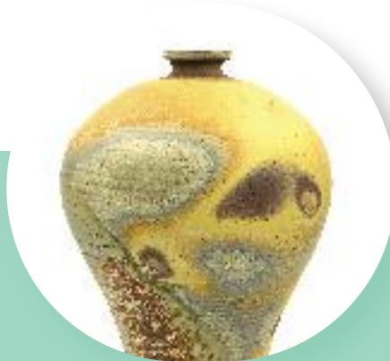
San Angelo National Ceramic Competition