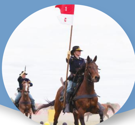
Fort Concho National Historic Landmark