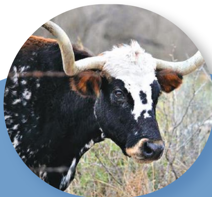
San Angelo State Park