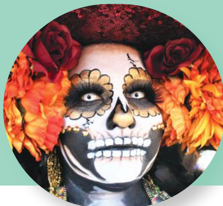
Dia de Los Muertos Celebration