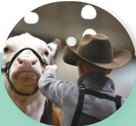
San Angelo Stock Show & Rodeo