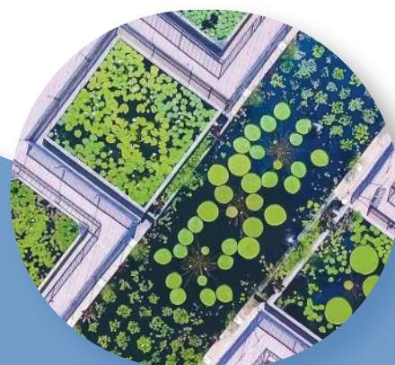
International Waterlily Collection