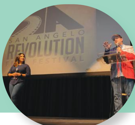
San Angelo REVOLUTION Film Festival