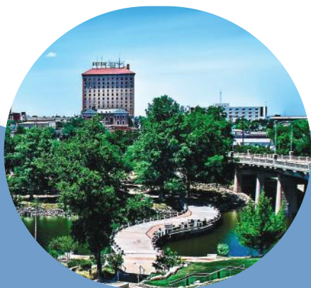
Celebration Bridge in Downtown San Angelo

Located along the Concho River, the San Angelo Visitor Center welcomes visitors upon arrival to the city and provides a rest area and information point for travelers. Quarried from local limestone, the serpentine structure is the most photographed area in San Angelo, with access to San Angelo's River Walk and pedestrian pathways to the historic city center.