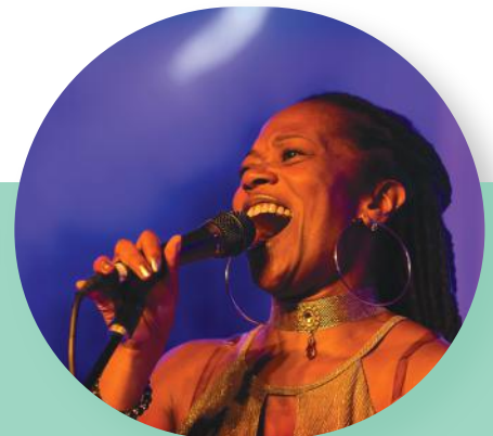
Simply Texas Blues Festival