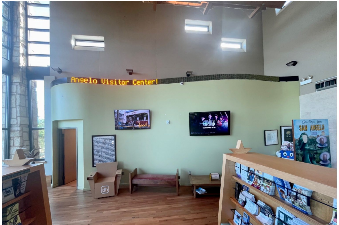
Interior wall where mural will reside.