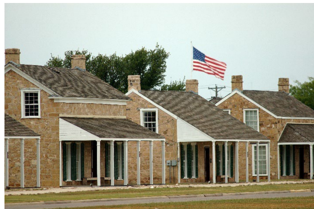
Fort Concho National Historic Landmark