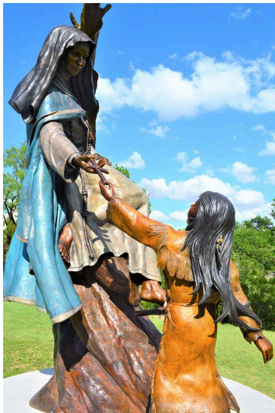
Lady In Blue Statue- Located at 320 S Oakes St